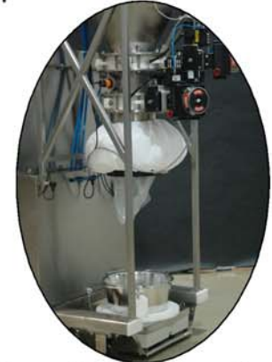
DoverPac ® Liner System