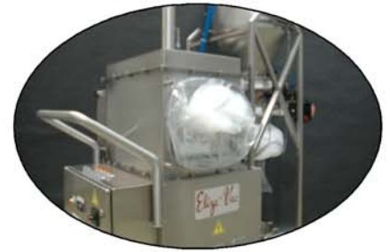
Hepa Filter Containment