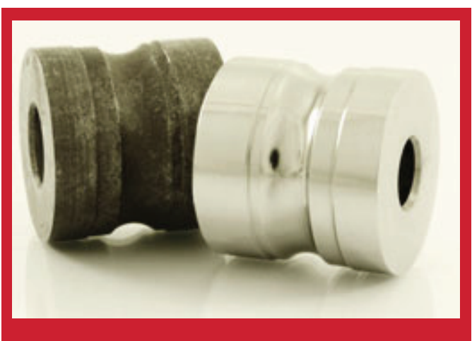
Die: Before & After use of Tool Polish